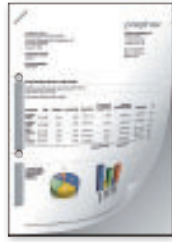
Stapling and Hole Punching