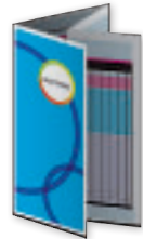
Double parallel Fold