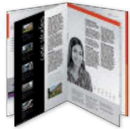
Saddle Stitching and Trimming