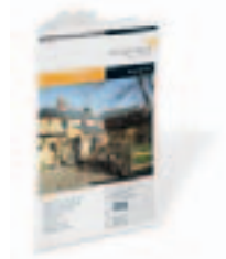
Saddle stitch Booklet creation