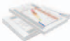
Group & collate