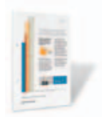
Hole punching (2 & 4 holes)