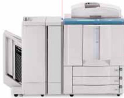
Available with optional paper tray

Fiery NetWise™ Ethernet, Token Ring, Web connectivity. Perform print jobs via email.