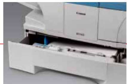
High capacity 500-sheet paper cassette