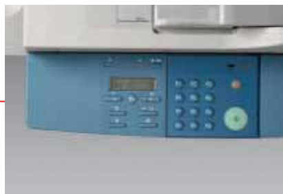
Clear control panel for ease of use