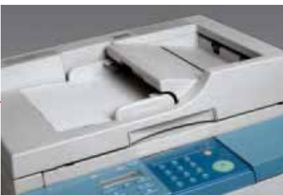
Productive Automatic Document Feeder

Busy offices faced with larger document workloads will find the optional Automatic Document Feeder (ADF) offers the easiest way to increase efficiency. It allows the machine to scan and copy all your multi-page documents automatically, leaving you free to get on with more important work.