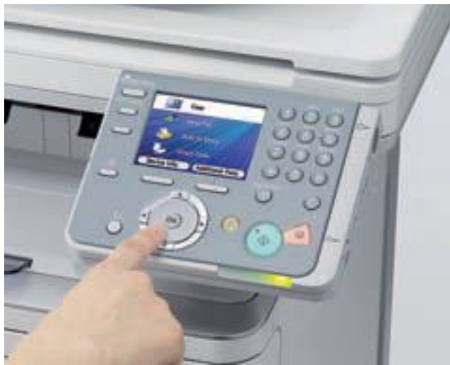
Easy-Scroll Wheel allows effortless access to all functions